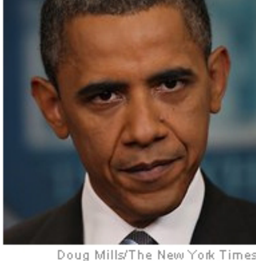
President Obama, about to turn 50, seems to have fared well in the aging process.

HIS hair is grayer, and the creases around his mouth have deepened. The bags under his eyes make him look a bit weary. But his brow is mostly smooth, his chin firm, his neck taut.